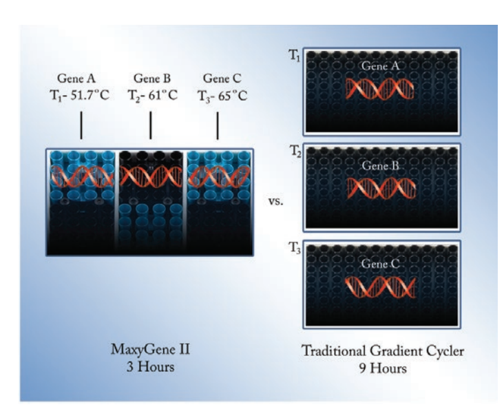
Figure 1. Primers designed to anneal to various genes (e.g., Gene A, B, and C) typically have different annealing temperatures (T_{12}, T_{22}, and T_{3}) . To simplify workflow and increase throughput, the MaxyGene II can perform up to six different reactions, significantly reducing steps and time.