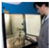
AIR FLOW SPEED TEST

Each Faster cabinet is tested conforming to EN 12469:2000, DIN 12980:2005 EN 61010:2001 and released with FAT certificate of the tests performed.