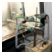
KI DISCUSS TEST