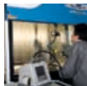
FILTER LEAKAGE TEST