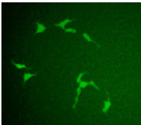
Figure 2. Transduction of HEK293 cells using AAV5 ZsGreen.

1 \times 10^5 cells/well were transduced in a 6-well plate with AAV5 ZsGreen at an MOI of 1 \times 10^4 . After 72 hours of transduction, ZsGreen expression in the target cells was observed under a fluorescence microscope. ZsGreen expression was stable over time and still observed 30 days after transduction.