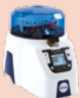
Precellys® Evolution Super Homogenizer