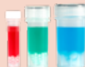
Lysing kits consumables