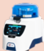
Precellys® 24 Touch Intuitive tissue Homogenizer