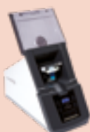
Minilys for personal use