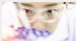
Research & Development