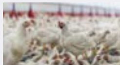
Food / Pharma / Veterinary / Industry