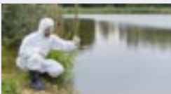
Pollution & Environment