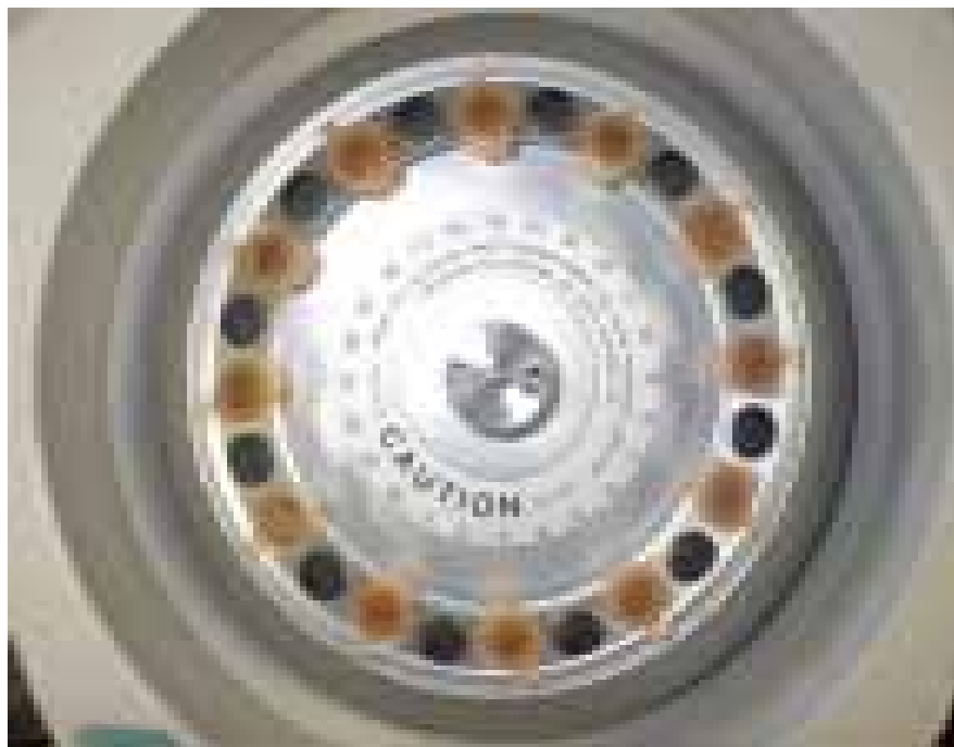
Figure 1. Loading the rotor to achieve balance

To replace rotor, first make sure the motor shaft and rotor mounting hole are clean. Place the rotor on the motor shaft. Reinstall the rotor securing screw on the motor shaft by turning it clockwise. Hold the rotor with one hand and tighten the rotor securing screw, using the rotor wrench.