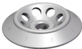
8 place tube rotor

The microcentrifuge is supplied with two interchangeable quick release rotors. No tools are required to exchange the rotors or attach them to the motor shaft. The rotors can be easily exchanged with one hand by way of the quick release system. Removal of the rotors is done by placing your thumb on top of the motor shaft and lifting up with two fingers underneath the rotor. Place the other rotor into position on the motor shaft and snap in.