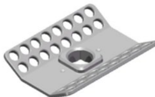
4 place strip rotor