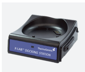
Corning X-LAB docking station