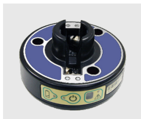
Corning X-LAB control module