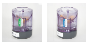
Corning X-Counterweights and Corning X-Balance ring kit