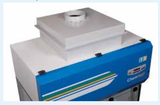
Additional filter housing with spigot for external ducting

ChemFAST unit may be optionally fitted with additional charcoal filter whenever the application requires for simultaneous use of different kind of solvents which can not be retained by standard charcoal filter.