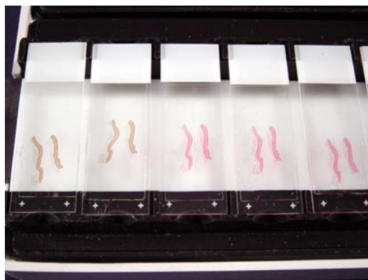
Removable contrast bar allows easy monitoring of chromogen development.

After chromogen development, slides are then rinsed, counterstained and are then ready for coverslipping.