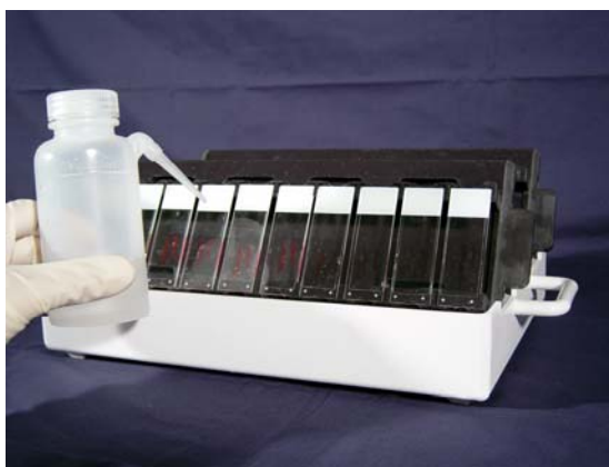
Rinse in one easy motion.