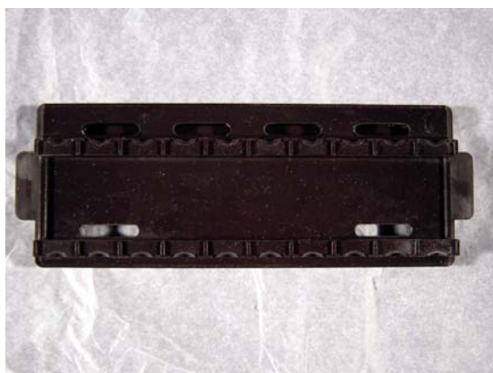
Slotted water reservoir (Upper slots and drain holes (lower slots))

To use, a hydrophobic barrier (PAP Pen, Catalog #LP0001) is drawn around the tissue section on each slide. Treated slides are then placed in the slide holder. 1-4 drops of reagent (50-200 \mu l) are placed on the tissue sections and incubated per manufactures protocol. After incubation, the individual slide holders can be tilted (slide into angled slots in base tray) at a 45° angle. All 20 slides are rinsed off in one easy motion and the buffer (PBS-Tween 20, Catalog # PBE500 or TBS-Tween 20, Catalog # TBE500) drains into the waste receptacle.