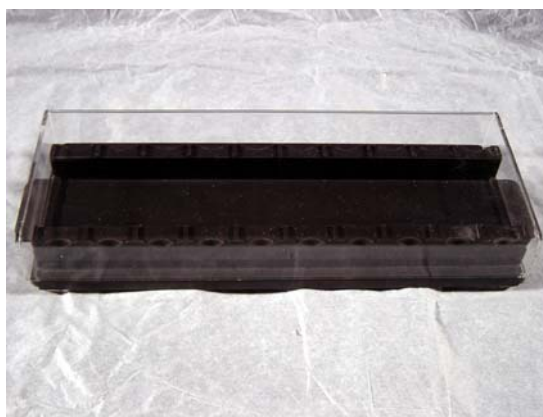
Individual humidity chamber.

To use, a hydrophobic barrier (PAP Pen, Catalog #LP0001) is drawn around the tissue section on each slide. Treated slides are then placed in the slide holder. 1-4 drops of reagent (50-200 \mu l) are placed on the tissue sections and incubated per manufactures protocol. After incubation, the individual slide holders can be tilted (slide into angled slots in base tray) at a 45° angle. All 20 slides are rinsed off in one easy motion and the buffer (PBS-Tween 20, Catalog # PBE500 or TBS-Tween 20, Catalog # TBE500) drains into the waste receptacle.