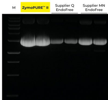
Up to 6x More Concentrated Plasmid