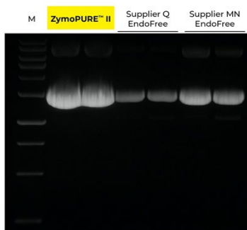
Up to 6x More Concentrated Plasmid