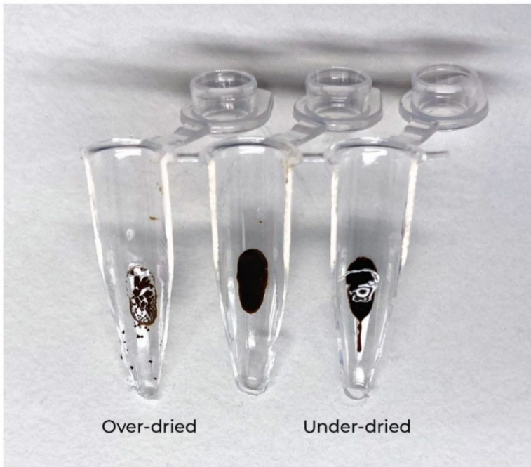
Figure 1. Over-dried beads are cracked and flakey, resembling dried mud. Under-dried beads are glossy and wet, like saturated mud. Optimally dried beads appear damp, but lack gloss.

Start with 5 minutes of air-dry time and adjust the time as needed to achieve optimally dried beads. Wash buffer carryover from insufficiently dried beads or overdried, cracked beads may reduce nucleic acid recovery.