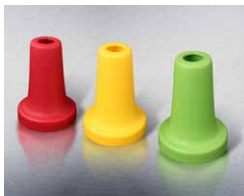
Extra nose pieces