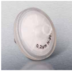
Hydrophobic PTFE filters