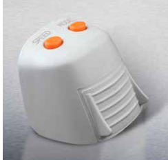
Battery cover with wings