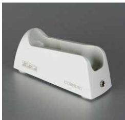
3 position charging stand