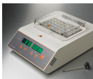
Double block digital dry bath heater