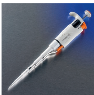
Corning Lambda Plus single-channel pipettor