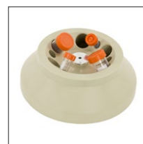
Combination rotor (Cat. No. 480143)