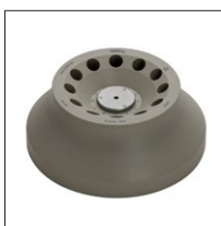
12 x 15 mL fixed angle rotor (Cat. No. 480137)