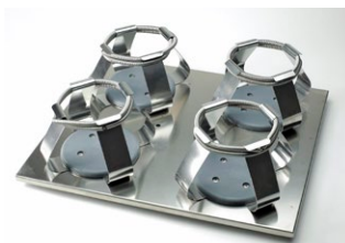
Cat. No. 480161