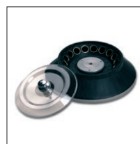
18 x 1.5 mL fixed angle rotor (Cat. No. 480139)