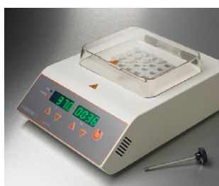
Single block digital dry bath heater