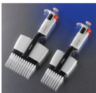
Corning Lambda Plus 8-channel and 12-channel pipettor