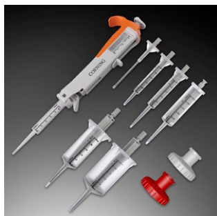
Corning Step-R Starter Pack