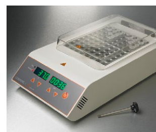
Four block digital dry bath heater