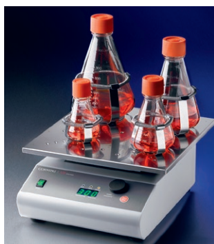
Orbital shaker with optional clamps and flasks

The Corning LSE orbital shaker meets a variety of shaking and mixing applications. A powerful brushless motor and counter-balanced shaker mechanism provides smooth operation for years of trouble-free use. Different platforms (order separately) are available and are easily interchangeable.