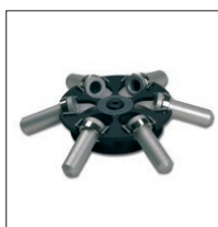
6 x 5 mL swing-out rotor (Cat. No. 480138)