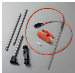
Digital hot plate accessories

When used with the digital hot plate or stirring hot plate, the external temperature controller ensures precision temperature accuracy of the liquid inside the vessel as opposed to the temperature of the hot plate top.