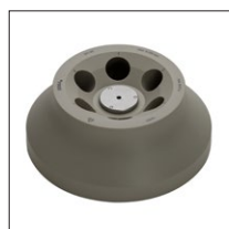
6 x 50 mL fixed angle rotor (Cat. No. 480136)