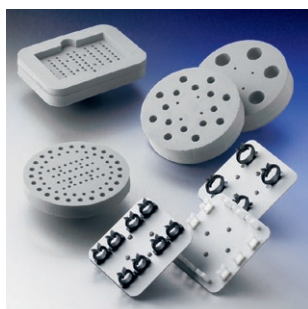
Accessory heads for Corning LSE vortex mixer