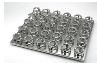
Cat. No. 480165