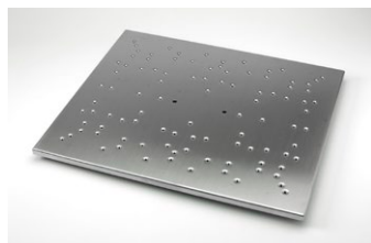
Cat. No. 480159