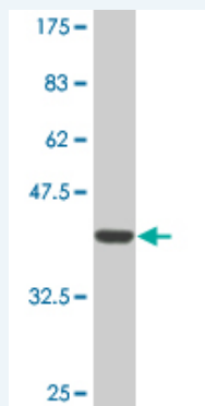
Western Blot detection against Immunogen (36.63 KDa) .

Quality Control Testing: Antibody Reactive Against Recombinant Protein.