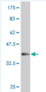
Western Blot detection against Immunogen (37.73 KDa) .

Quality Control Testing: Antibody Reactive Against Recombinant Protein.