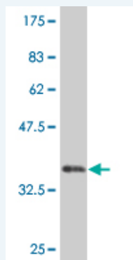
Western Blot detection against Immunogen (35.79 KDa) .

Quality Control Testing: Antibody Reactive Against Recombinant Protein.