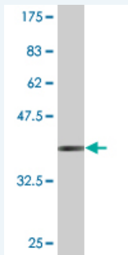
Western Blot detection against Immunogen (36.74 KDa) .

Quality Control Testing: Antibody Reactive Against Recombinant Protein.