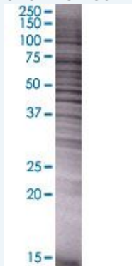
ST3GAL3 transfected lysate.