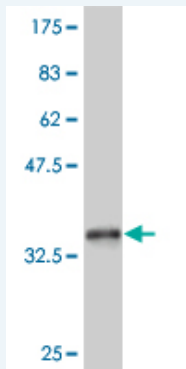
Western Blot detection against Immunogen (36.78 KDa) .

Quality Control Testing: Antibody Reactive Against Recombinant Protein.