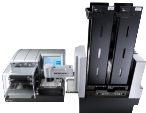
405TS interfaces with BioStack for automated multiple plate processing.