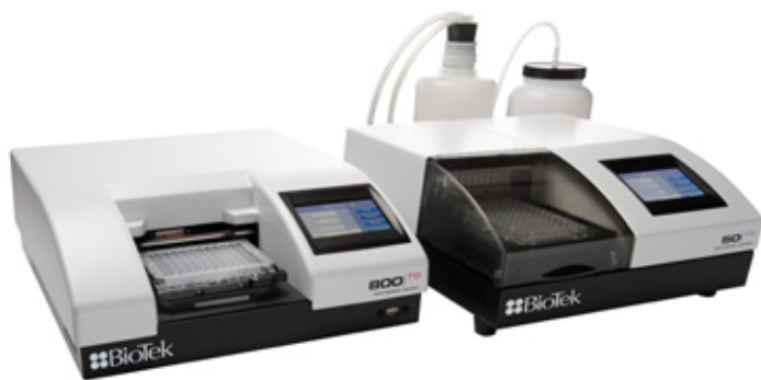
BioTek's 800™ TS Reader is ideal for pairing with 50™ TS Washer for routine workflows.