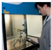
AIR FLOW SPEED TEST

Each Faster cabinet is tested conforming to EN - 12469:2000, EN - 61010:2001 and released with FAT certificate of the tests performed.