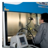
FILTER LEAKAGE TEST