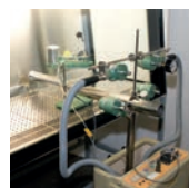
KI DISCUSS TEST