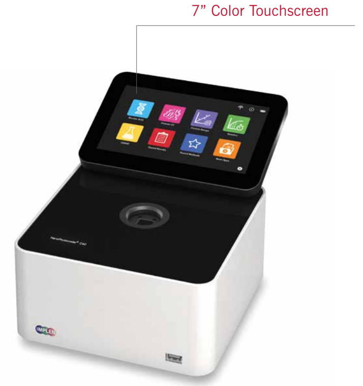
7" Color Touchscreen